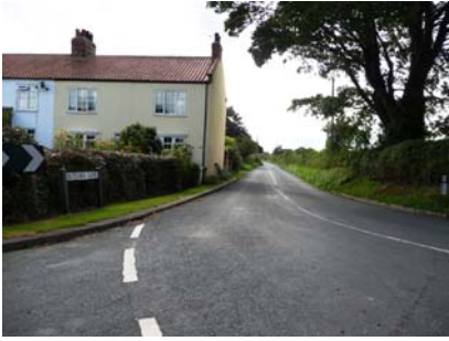
1. Start at the Noticeboard on Cooper Lane and walk West down Butcher Lane