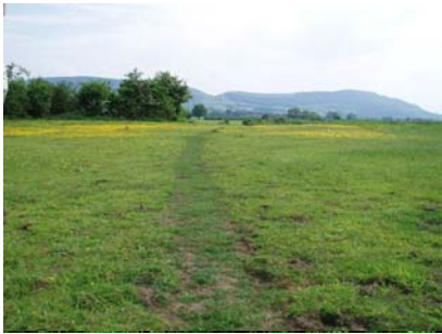
5. Follow the path diagonally across the meadow