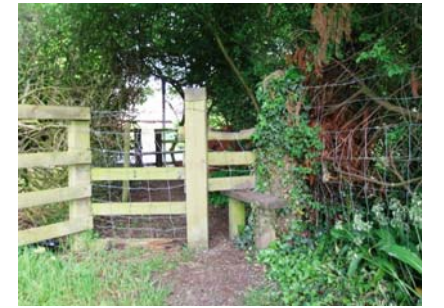
12. Climb over the last stile into Cooper Lane and walk back to the Start