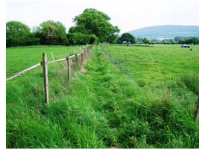
9. Walk on the path between the wire fences