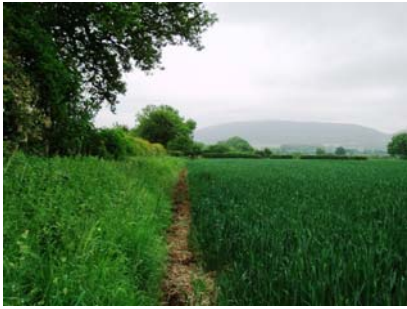
3. Walk along the edge of the cultivated field towards the hills