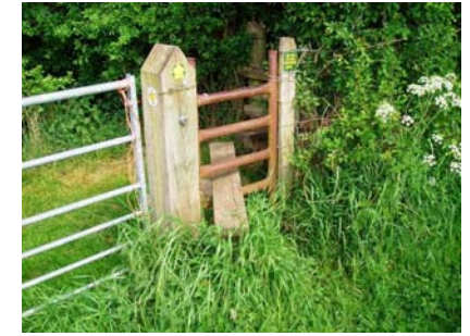
10. Climb over the stile on the left and walk alongside the fence