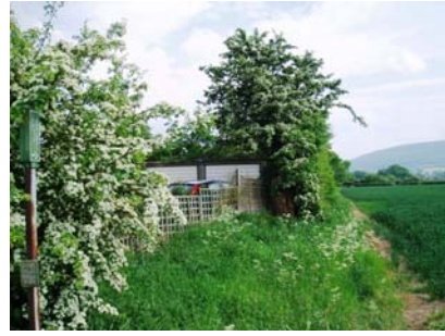
2. Turn left into the field opening just past Lane House