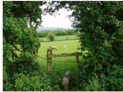
6. Climb over the stile in the left side hedge and then turn right