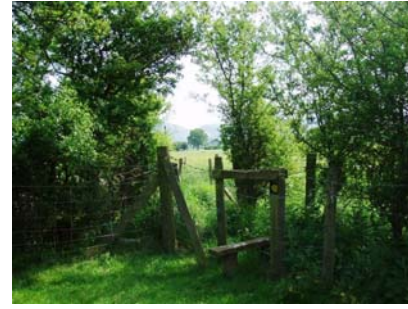
7. Climb the stile on the right in the corner of the field