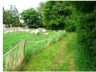
11. Follow the footpath which runs alongside the Green Lane