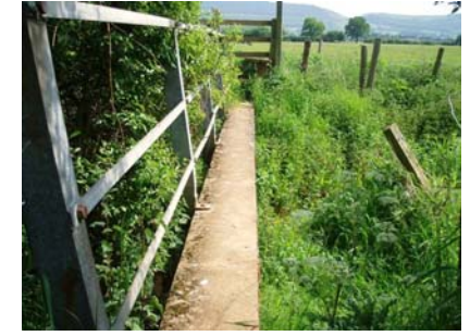
8. Cross the narrow concrete bridge and over the next stile.