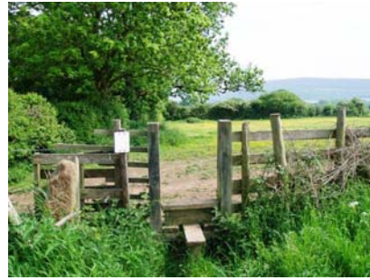
4. Climb over the stile in the corner of the field