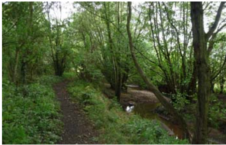
5. The path is sheltered by trees, including some Alders.