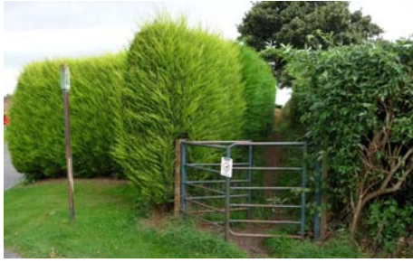
1. Go through the roadside "Kissing Gate", along the short narrow path to a small metal gate into a field.