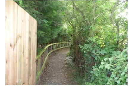
10. The path then follows the fence around the edge of some gardens