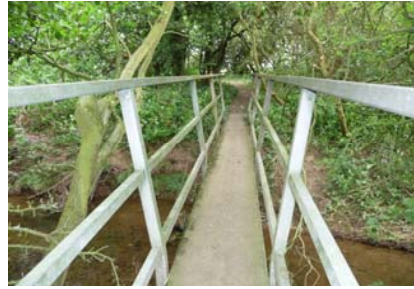
4. Turn Right (South) onto the Footpath and follow it along Potto Beck.