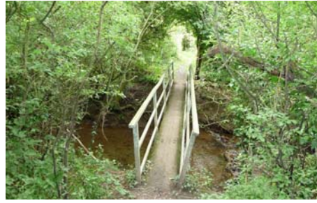
7. Turn Right at the footpaths junction (footbridges are on both Left and Right sides)