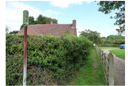
12. Turn Right up Cooper Lane to go back to the Dog and Gun pub.