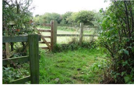
9. Follow the well marked footpath which goes around a field and is muddy.