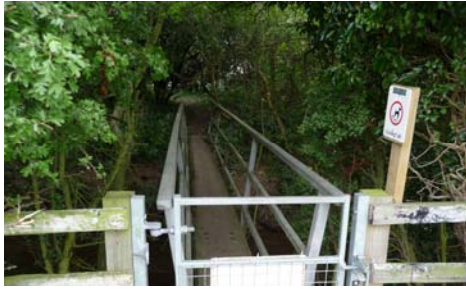
3. Go through the gate at the bottom of the field and cross over the bridge