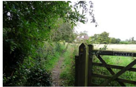
11. Follow the well marked path alongside another field until you reach the road.