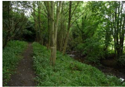
6. Look and listen carefully, as you may hear Dippers, Herons and many other birds, maybe even the odd Kingfisher. Very occasionally some Deer.