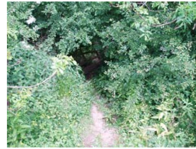
19. Go through the gap in the trees