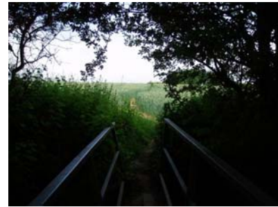
28. Cross the wooden bridge over the watercourse