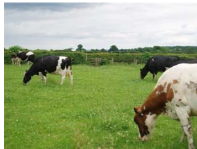
6. Go straight across the middle of the field towards the stile opposite