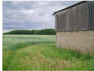
16. Keep right, alongside the barn and then head diagonally towards the wire fence line