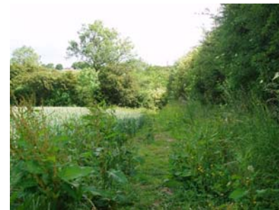
23. Keep right against the field side and go straight ahead