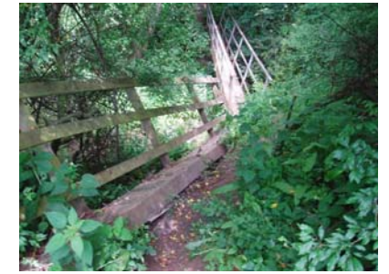
20. Decend the steep bank and cross the concrete bridge with care