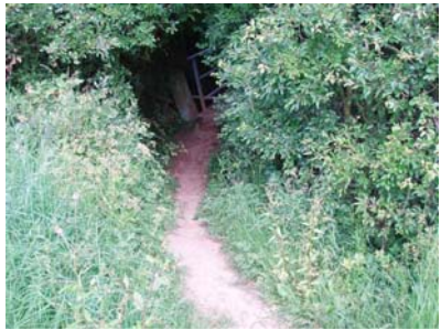
27. Go through the hedge and down the small slope