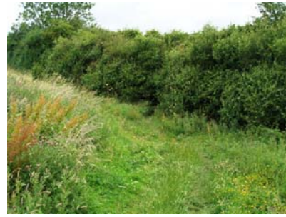
26. At the edge of the field, head towards the gap in the hedge a few yards to the left