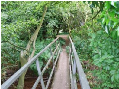
3. Keep right to the far end of the field, go through the metal gate and cross the footbridge