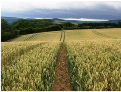
25. As you reach the middle of the field, look back at the Cleveland Hills