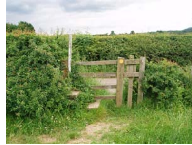
7. Climb over the stile and turn left onto the surfaced track