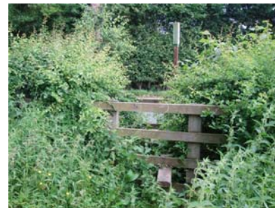
11. Climb over the double stile in the far left (North West) corner of the field and turn left into Goulton Lane