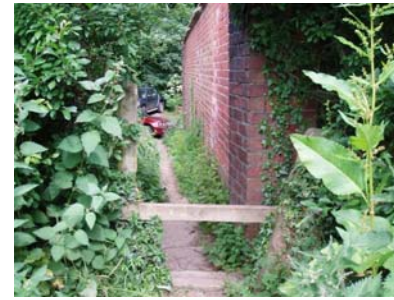
31. Climb over the fence in the far corner of the field