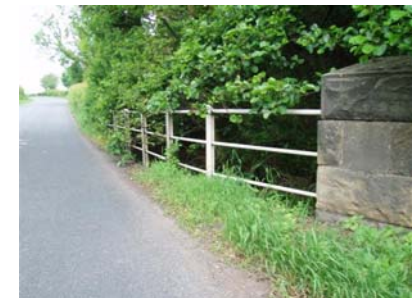
12. Cross the bridge over Potto Beck and keep right for 100 yards on the road