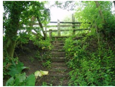
14. Walk across the middle of the small field, climb the wooden steps and stile into a field