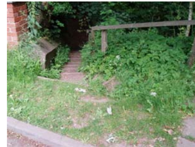
33. Decend the wooden steps onto the path under the trees