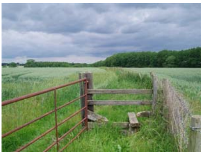
17. Cross the stile next to the metal gate and keep straight ahead for 500 yards