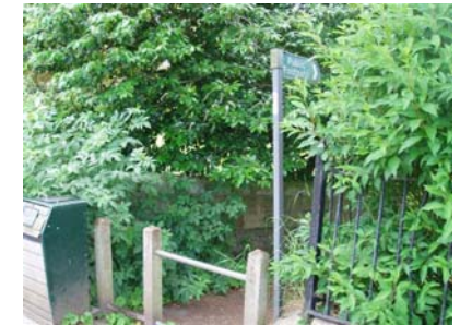
34. Climb over the stile and turn right into The Wynd