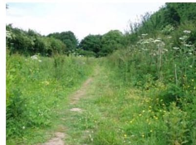
30. Walk through the gap and keep straight towards the far end of the triangular field