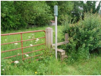
13. Turn right over the stile at the footpath sign near the top of the inclined road