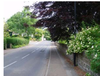
35. Walk on the pavement towards Hutton Rudby village green