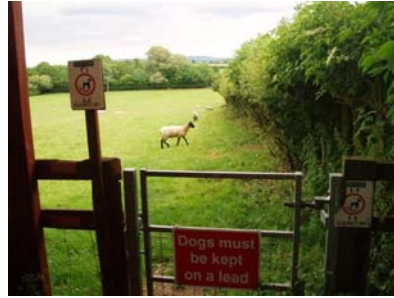
2. Walk along the short narrow path and enter the field at the metal gate