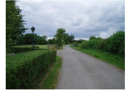
8. Walk straight for 500 yards on the track, past farms and stables