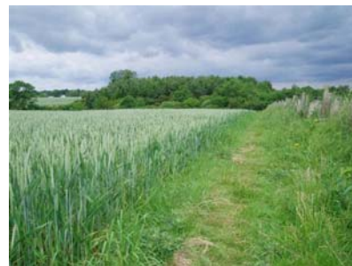
18. Keep straight ahead alongside the wire fence at the edge of the large field