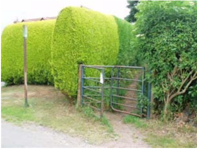
1. Start at the Dog and Gun pub on Cooper Lane and go through the kissing gate