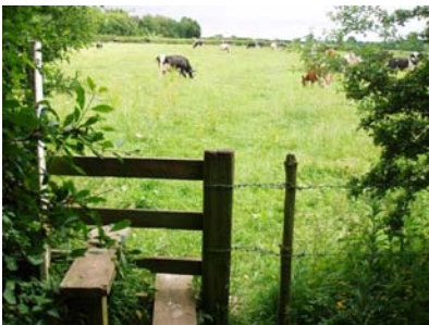
5. Climb over the stile into the field, which may contain livestock