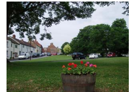
36. The picturesque village green has seating and a convenience store