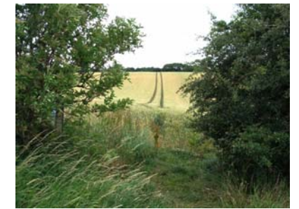
24. Go through the gap in the hedge and go straight ahead across the field