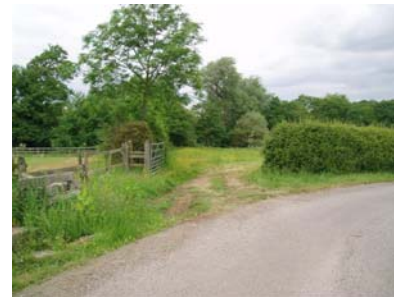
9. Where the track turns sharp right, go straight ahead through stile into field