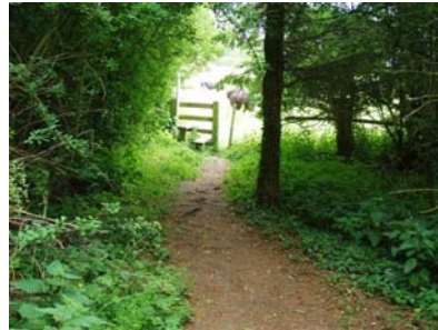
4. Walk straight ahead across the path of the of the old railway