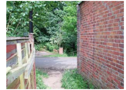
32. Follow the high brick wall and cross straight over Sexhow Lane