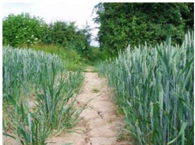
29. Walk straight across the middle of the next field towards a gap in the hedge