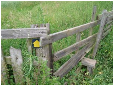
15. Cross the field, heading towards the stile at the front left corner of the white farmhouse