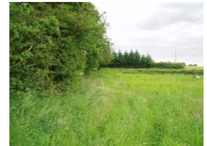
10. Keep left in the field, alongside Potto Beck, where the path is poorly marked