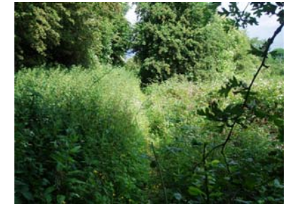
22. Walk ahead through a lovely wooded area with brambles